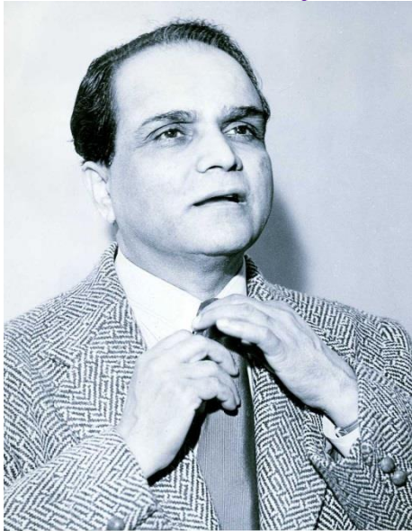
A.K. Mozumdar 1940

I will add different quotes from A.K Mozumdar in each newsletter as his thoughts are as timely today as they were at any time. If you would like to download some reading material by A.K Mozumdar you can go to Mozumdar.org where there are several books available in pdf format.