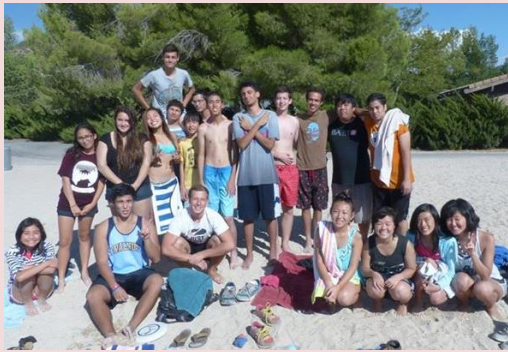
~The Pillars of God~

The Los Angeles Family Church Youth group recently came up and worked on the trail to the Holy Spot and other areas around the camp. They are seen here taking a break down at Silverwood lake.