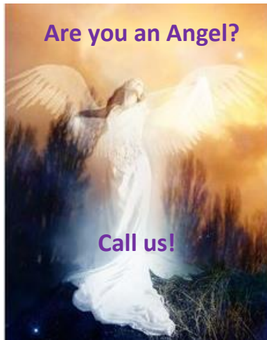
The Temple of Christ

weeds, leaves and much of the broken concrete has been removed! All of the old benches have been disassembled and the brackets and hardware have been salvaged. The parking lots around the Pillars have been expanded and we are working to put down wood chips by October 4 th . The old kitchen and office have been completely gutted and that effort has been led by Michael Ginze.